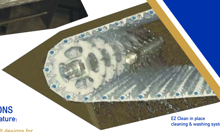
EZ Clean in place cleaning & washing system

Partnering with Clients From Conception to Completion Project Management Sound Engineering Practices Innovation Design Manufacture & Installation Process Plant & Equipment Process Plant Refurbishment